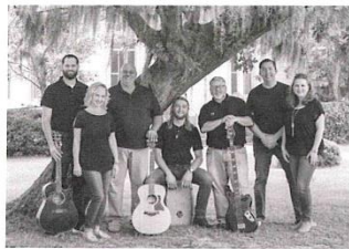
The Goshen Travelers

Note: Commuters are welcome to attend and may pay the $25 fee at registration. Please pay for any meals at the front desk before entering the serving line.